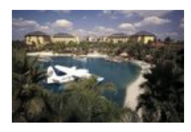
Loews Royal Pacific Resort Orlando, Florida

This was one of our classiest events yet! The venue was reminiscent of a beautiful tropical Island hide-a-way located in Orlando, Florida's famed Universal Studios. The seminars were awesome, the Island buffet fantastic; and the attendees representative of the best of the best from around the world