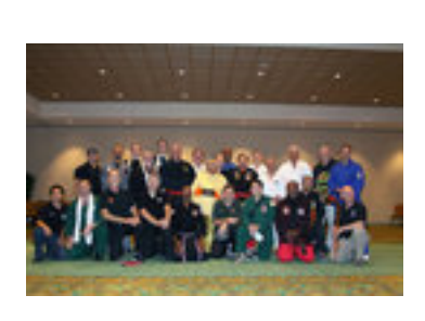
Seminar leaders pose for picture